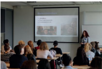
Giving a presentation to a group of 60 future students about the projects of my study

Giving presentations about the study, supporting teachers in presentations, welcoming and helping new students, and encouraging students to fill in surveys.